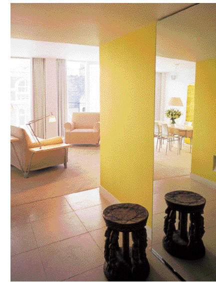
(Penthouse) 가 Todd Eberle