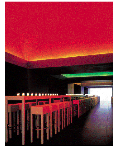
(Light Bar) 가 Todd Eberle