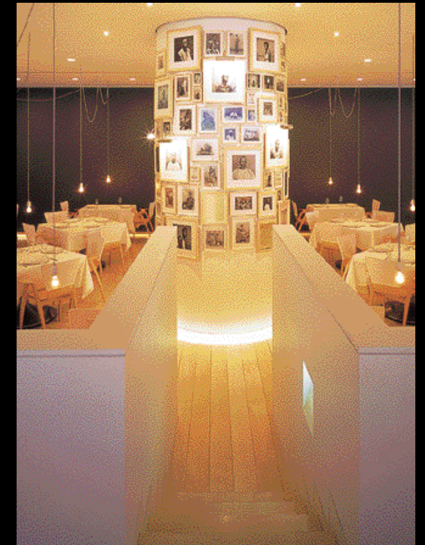
(Asia de Cuba Restaurant) | Todd Eberle