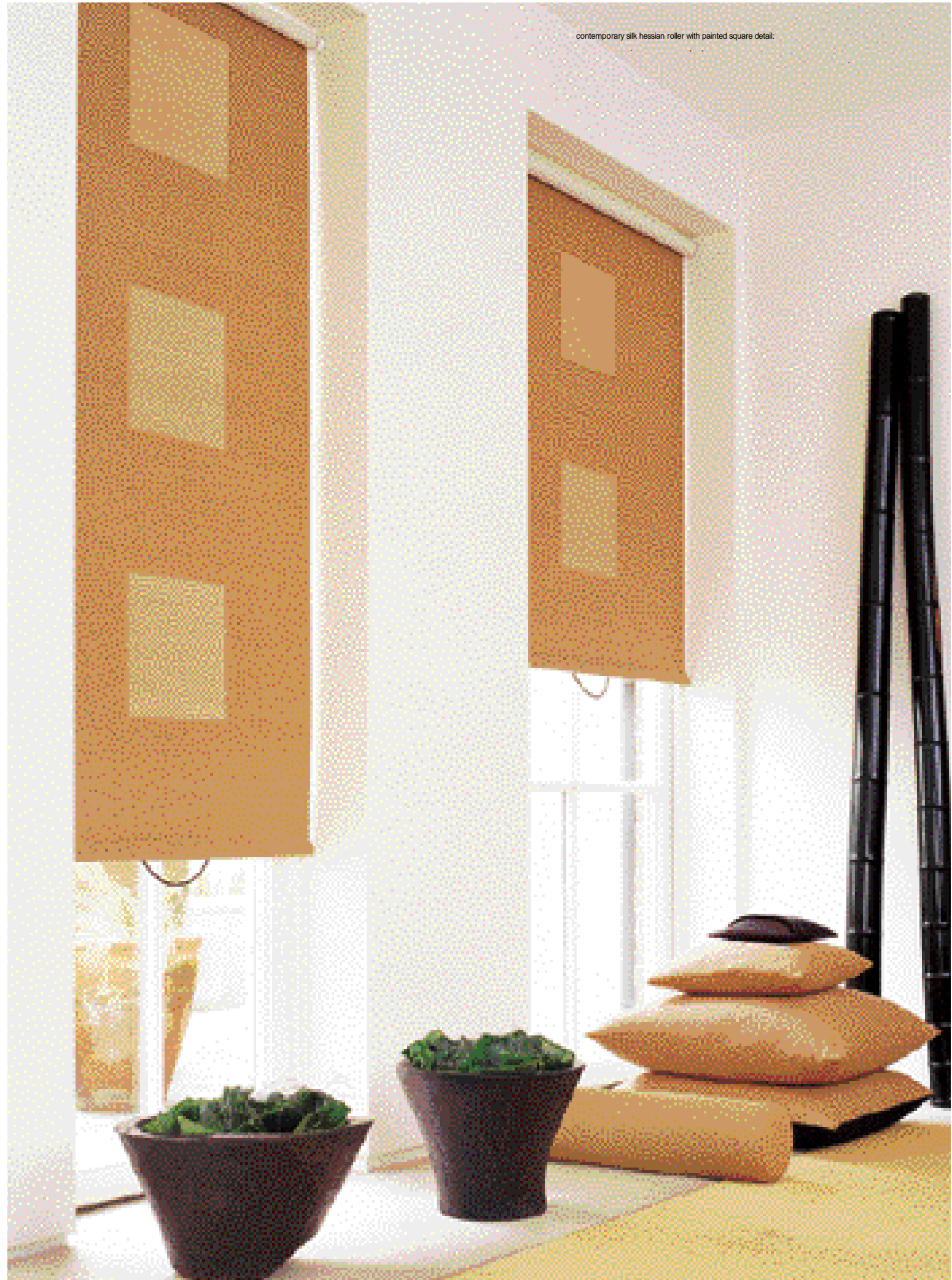
contemporary silk hessian roller with painted square detail.

(British Airways) 1 (Fired Earth) (Perfect Neutral) (East Meets West) > (1997) (Table Chic) >, < (In Touch) >